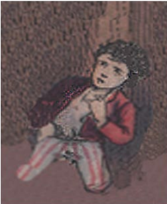
From the story Hop O' My Thumb , picture 4.